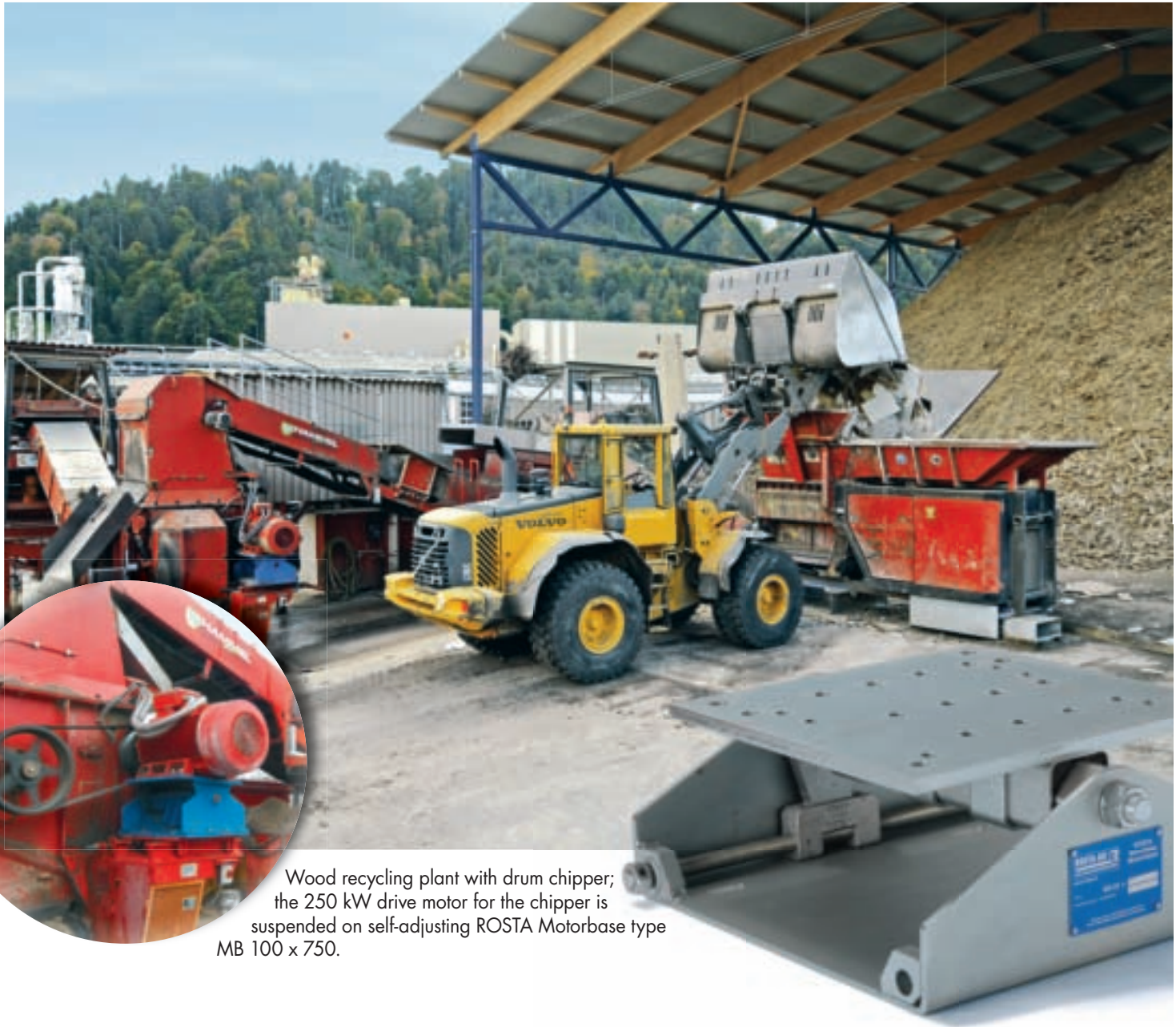
Wood recycling plant with drum chipper; the 250 kW drive motor for the chipper is suspended on self-adjusting ROSTA Motorbase type MB 100 x 750.