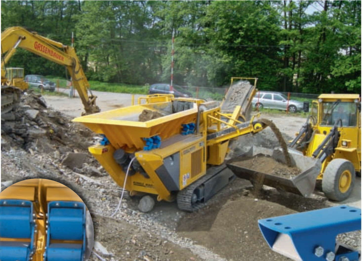
«RUBBLE MASTER» mobile construction waste crusher and screening plant for the recycling of asphalt and rubblestone to produce new road bed materials. Feed chute suspended on ROSTA Type AB-HD 50-2 oscillating mountings.