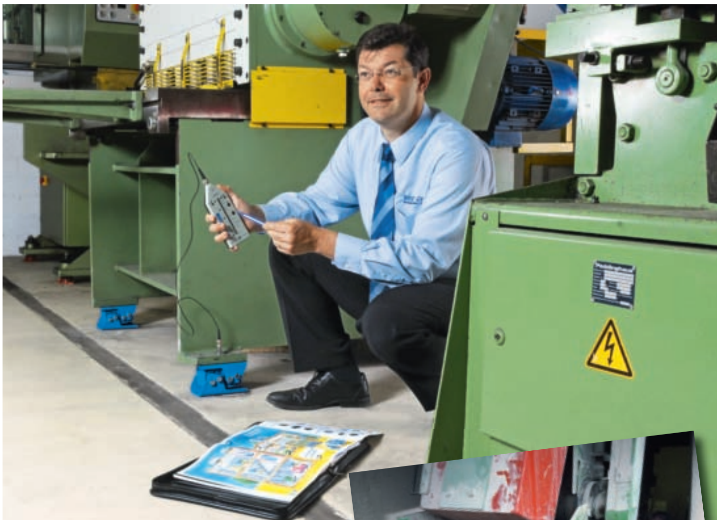
ROSTA sales engineers providing customer consultation on-site.