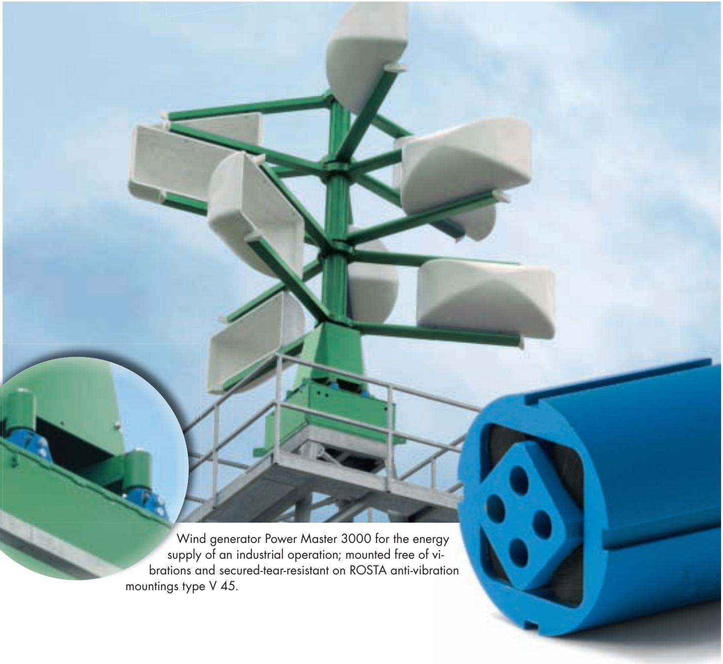
Wind generator Power Master 3000 for the energy supply of an industrial operation; mounted free of vibrations and secured-tear-resistant on ROSTA anti-vibration mountings type V 45.